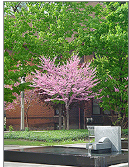
Eastern Redbud (tree form) in bloom