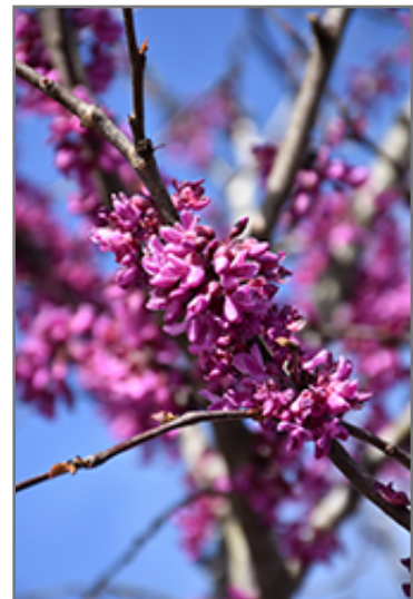
Eastern Redbud (tree form) flowers

We are so proud of the nursery stock that we have carefully selected for superior quality and performance, WE GUARANTEE ALL TREES, SHRUBS, EVERGREENS FOR 2 YEARS, AND ROSES FOR 1 YEAR!