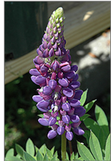
Gallery Blue Lupine flowers

We are so proud of the nursery stock that we have carefully selected for superior quality and performance, WE GUARANTEE ALL TREES, SHRUBS, EVERGREENS FOR 2 YEARS, AND ROSES FOR 1 YEAR!