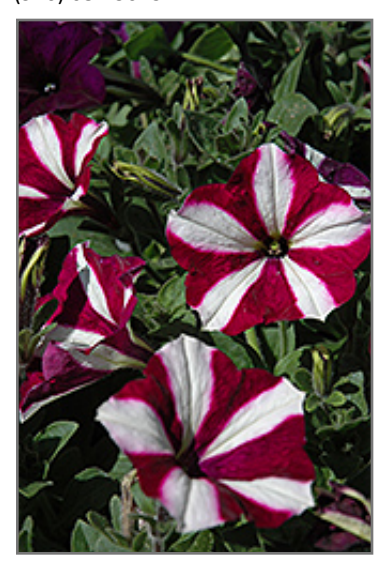
Easy Wave Burgundy Star Petunia flowers

Easy Wave Burgundy Star Petunia is a dense herbaceous annual with a trailing habit of growth, eventually spilling over the edges of hanging baskets and containers. Its medium texture blends into the garden, but can always be balanced by a couple of finer or coarser plants for an effective composition.