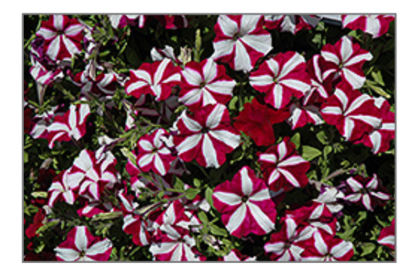
Easy Wave Burgundy Star Petunia flowers