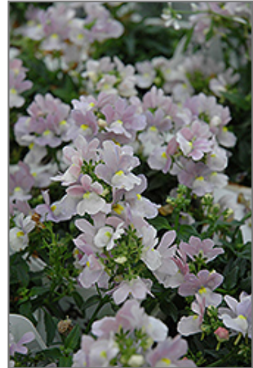
Opal Innocence Nemesia flowers

We are so proud of the nursery stock that we have carefully selected for superior quality and performance, WE GUARANTEE ALL TREES, SHRUBS, EVERGREENS FOR 2 YEARS, AND ROSES FOR 1 YEAR!