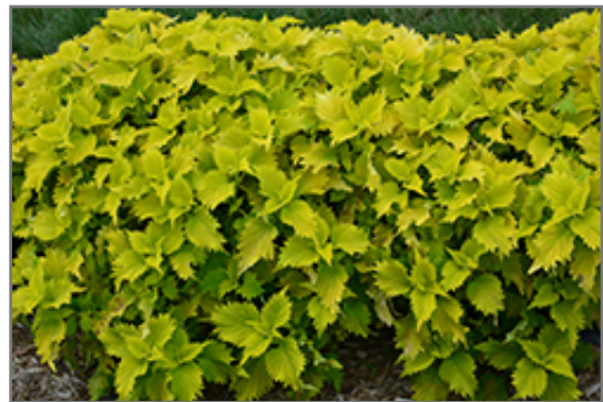
Wasabi Coleus

We are so proud of the nursery stock that we have carefully selected for superior quality and performance, WE GUARANTEE ALL TREES, SHRUBS, EVERGREENS FOR 2 YEARS, AND ROSES FOR 1 YEAR!