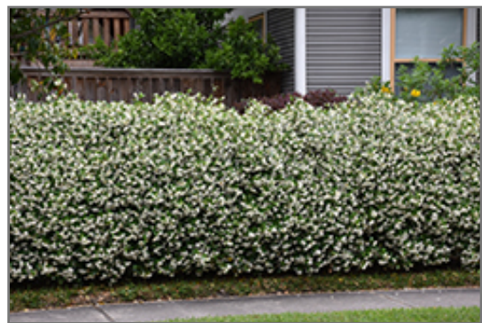
Confederate Star-Jasmine in bloom

We are so proud of the nursery stock that we have carefully selected for superior quality and performance, WE GUARANTEE ALL TREES, SHRUBS, EVERGREENS FOR 2 YEARS, AND ROSES FOR 1 YEAR!