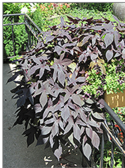
Proven Accents Blackie Sweet Potato Vine

We are so proud of the nursery stock that we have carefully selected for superior quality and performance, WE GUARANTEE ALL TREES, SHRUBS, EVERGREENS FOR 2 YEARS, AND ROSES FOR 1 YEAR!