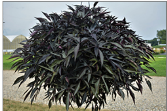
Illusion Midnight Lace Sweet Potato Vine

We are so proud of the nursery stock that we have carefully selected for superior quality and performance, WE GUARANTEE ALL TREES, SHRUBS, EVERGREENS FOR 2 YEARS, AND ROSES FOR 1 YEAR!