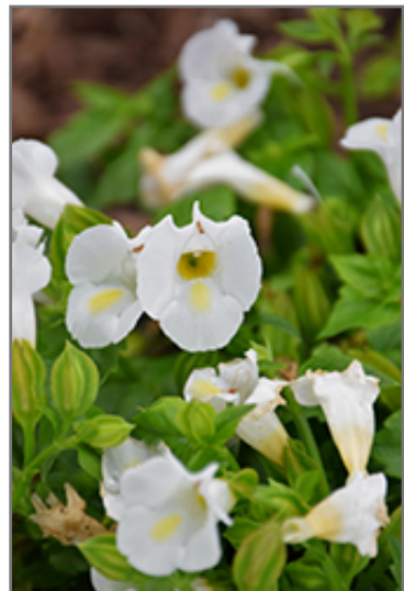
Catalina White Linen Torenia flowers

We are so proud of the nursery stock that we have carefully selected for superior quality and performance, WE GUARANTEE ALL TREES, SHRUBS, EVERGREENS FOR 2 YEARS, AND ROSES FOR 1 YEAR!