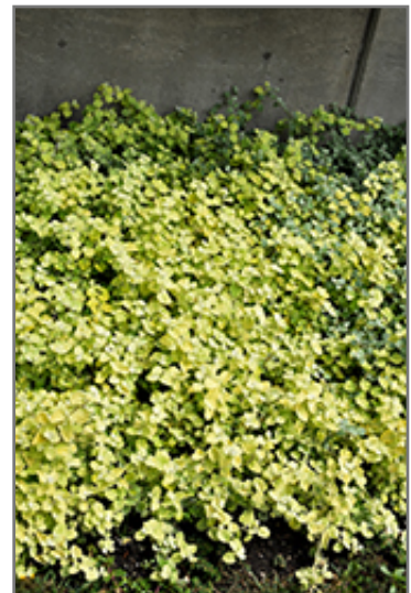
Lemon Licorice Plant

We are so proud of the nursery stock that we have carefully selected for superior quality and performance, WE GUARANTEE ALL TREES, SHRUBS, EVERGREENS FOR 2 YEARS, AND ROSES FOR 1 YEAR!