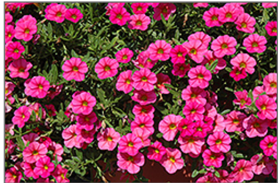
Cabaret Hot Pink Calibrachoa flowers

Cabaret Hot Pink Calibrachoa is recommended for the following landscape applications;