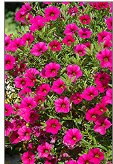
Cabaret Rose Calibrachoa flowers

We are so proud of the nursery stock that we have carefully selected for superior quality and performance, WE GUARANTEE ALL TREES, SHRUBS, EVERGREENS FOR 2 YEARS, AND ROSES FOR 1 YEAR!