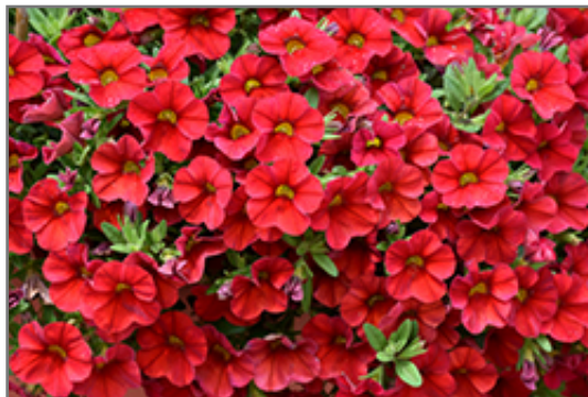
Superbells Red Calibrachoa flowers

This plant will require occasional maintenance and upkeep. Trim off the flower heads after they fade and die to encourage more blooms late into the season. It is a good choice for attracting bees and hummingbirds to your yard, but is not particularly attractive to deer who tend to leave it alone in favor of tastier treats. It has no significant negative characteristics.