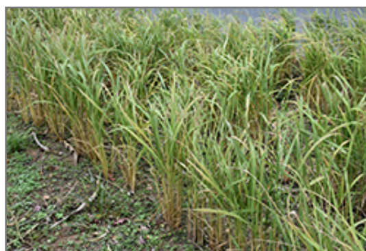
Asian Rice

We are so proud of the nursery stock that we have carefully selected for superior quality and performance, WE GUARANTEE ALL TREES, SHRUBS, EVERGREENS FOR 2 YEARS, AND ROSES FOR 1 YEAR!