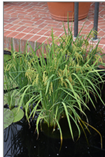
Asian Rice in bloom