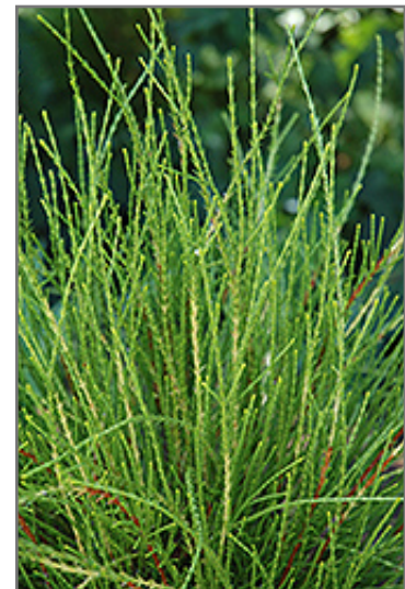
Franky Boy Arborvitae foliage

We are so proud of the nursery stock that we have carefully selected for superior quality and performance, WE GUARANTEE ALL TREES, SHRUBS, EVERGREENS FOR 2 YEARS, AND ROSES FOR 1 YEAR!