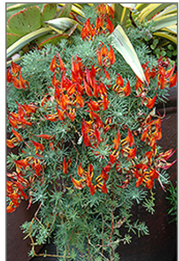
Amazon Sunset Parrots Beak in bloom

We are so proud of the nursery stock that we have carefully selected for superior quality and performance, WE GUARANTEE ALL TREES, SHRUBS, EVERGREENS FOR 2 YEARS, AND ROSES FOR 1 YEAR!