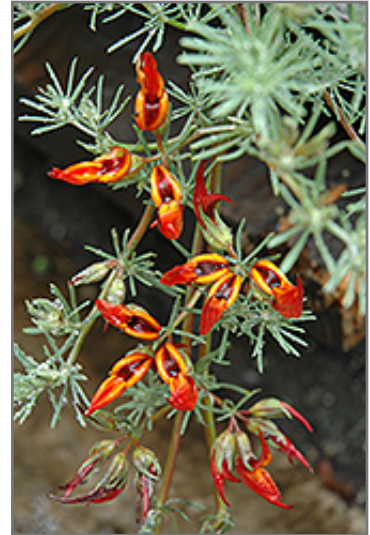
Amazon Sunset Parrots Beak flowers

Amazon Sunset Parrots Beak is recommended for the following landscape applications;