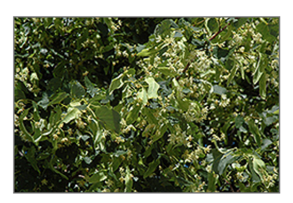
Greenspire Linden flowers