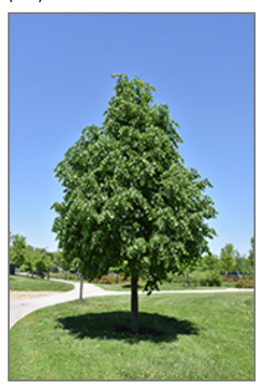
Greenspire Linden

Greenspire Linden is a dense deciduous tree with a strong central leader and a distinctive and refined pyramidal form. Its average texture blends into the landscape, but can be balanced by one or two finer or coarser trees or shrubs for an effective composition.