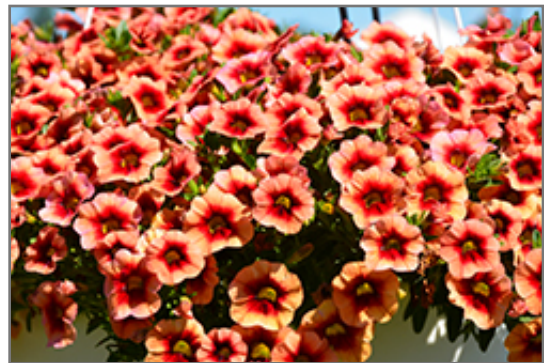
Hula Orange Calibrachoa flowers

We are so proud of the nursery stock that we have carefully selected for superior quality and performance, WE GUARANTEE ALL TREES, SHRUBS, EVERGREENS FOR 2 YEARS, AND ROSES FOR 1 YEAR!