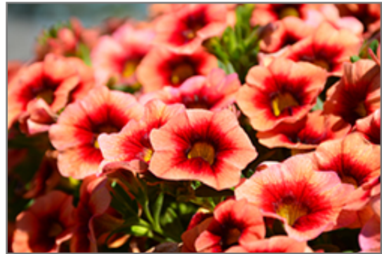
Hula Orange Calibrachoa flowers

This plant will require occasional maintenance and upkeep. Trim off the flower heads after they fade and die to encourage more blooms late into the season. It is a good choice for attracting bees and hummingbirds to your yard, but is not particularly attractive to deer who tend to leave it alone in favor of tastier treats. It has no significant negative characteristics.