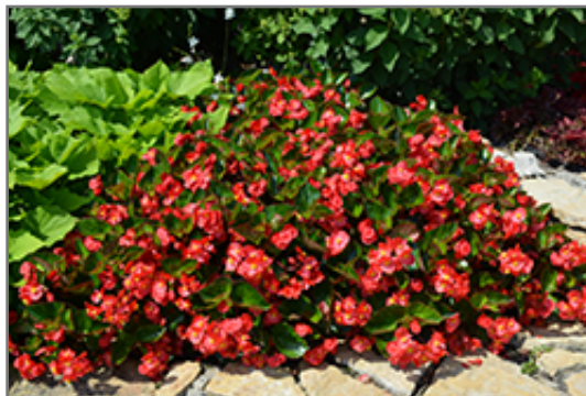
Surefire Red Begonia in bloom