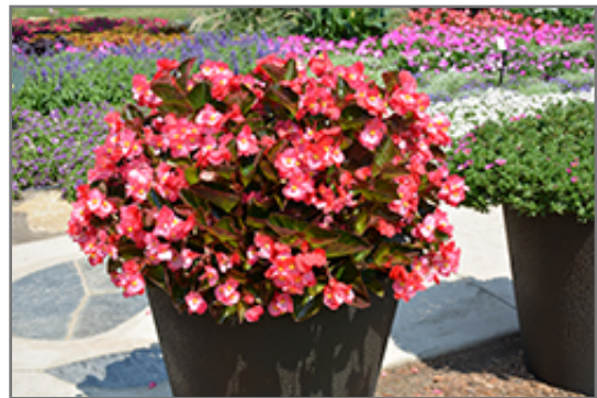
Surefire Red Begonia in bloom

We are so proud of the nursery stock that we have carefully selected for superior quality and performance, WE GUARANTEE ALL TREES, SHRUBS, EVERGREENS FOR 2 YEARS, AND ROSES FOR 1 YEAR!