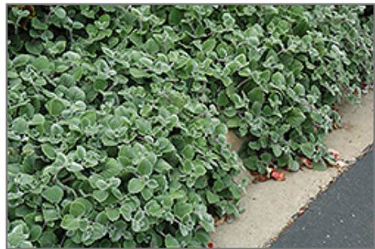
Silver Shield Plectranthus

We are so proud of the nursery stock that we have carefully selected for superior quality and performance, WE GUARANTEE ALL TREES, SHRUBS, EVERGREENS FOR 2 YEARS, AND ROSES FOR 1 YEAR!