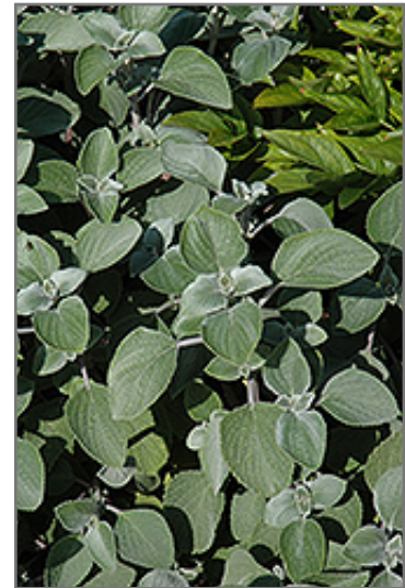
Silver Shield Plectranthus foliage

This is a relatively low maintenance plant, and can be pruned at anytime. It has no significant negative characteristics.