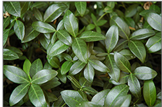
Bowles Periwinkle foliage