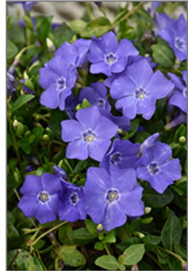
Bowles Periwinkle flowers

Bowles Periwinkle is an herbaceous evergreen perennial with a ground-hugging habit of growth. Its medium texture blends into the garden, but can always be balanced by a couple of finer or coarser plants for an effective composition.