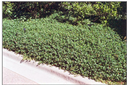
Bowles Periwinkle

We are so proud of the nursery stock that we have carefully selected for superior quality and performance, WE GUARANTEE ALL TREES, SHRUBS, EVERGREENS FOR 2 YEARS, AND ROSES FOR 1 YEAR!