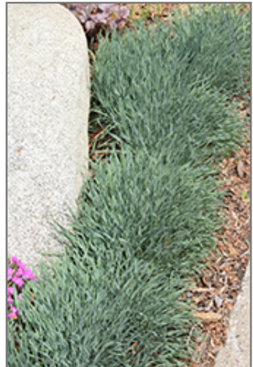
Blue Eddy Ornamental Onion

We are so proud of the nursery stock that we have carefully selected for superior quality and performance, WE GUARANTEE ALL TREES, SHRUBS, EVERGREENS FOR 2 YEARS, AND ROSES FOR 1 YEAR!