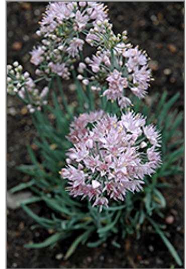
Blue Eddy Ornamental Onion flowers

This is a relatively low maintenance plant, and should only be pruned after flowering to avoid removing any of the current season's flowers. It is a good choice for attracting butterflies to your yard, but is not particularly attractive to deer who tend to leave it alone in favor of tastier treats. It has no significant negative characteristics.