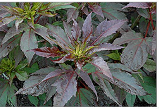
Midnight Marvel Hibiscus foliage