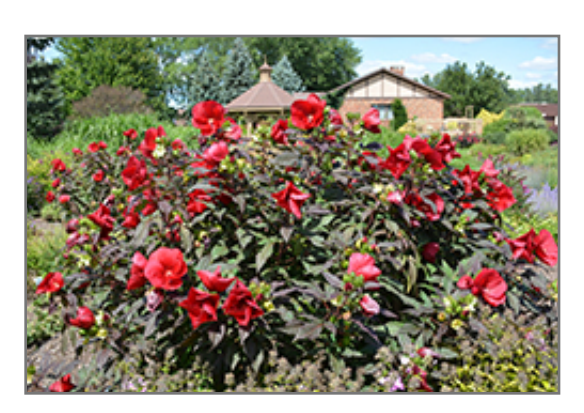
Midnight Marvel Hibiscus in bloom