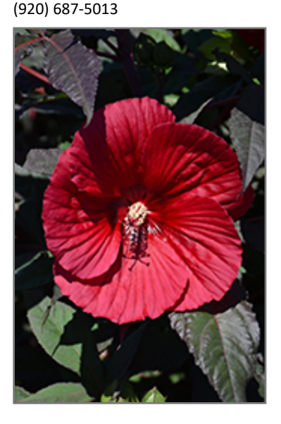
Midnight Marvel Hibiscus flowers

Midnight Marvel Hibiscus is an herbaceous perennial with an upright spreading habit of growth. Its relatively coarse texture can be used to stand it apart from other garden plants with finer foliage.