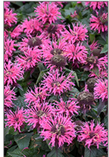
Bubblegum Blast Beebalm flowers

We are so proud of the nursery stock that we have carefully selected for superior quality and performance, WE GUARANTEE ALL TREES, SHRUBS, EVERGREENS FOR 2 YEARS, AND ROSES FOR 1 YEAR!