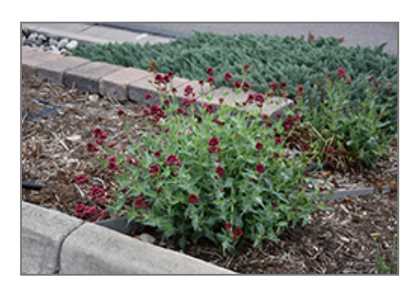
Red Valerian in bloom