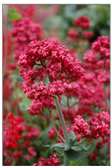
Red Valerian flowers