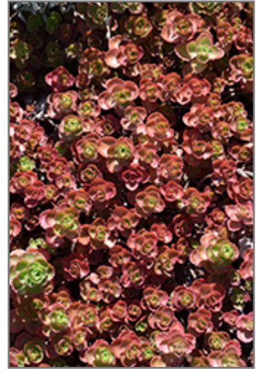
Dragon's Blood Stonecrop in fall

Dragon's Blood Stonecrop is a dense herbaceous perennial with a ground-hugging habit of growth. It brings an extremely fine and delicate texture to the garden composition and should be used to full effect.