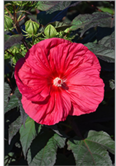
Mars Madness Hibiscus flowers

Mars Madness Hibiscus is an herbaceous perennial with an upright spreading habit of growth. Its relatively coarse texture can be used to stand it apart from other garden plants with finer foliage.