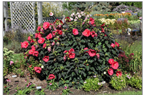
Mars Madness Hibiscus in bloom

We are so proud of the nursery stock that we have carefully selected for superior quality and performance, WE GUARANTEE ALL TREES, SHRUBS, EVERGREENS FOR 2 YEARS, AND ROSES FOR 1 YEAR!