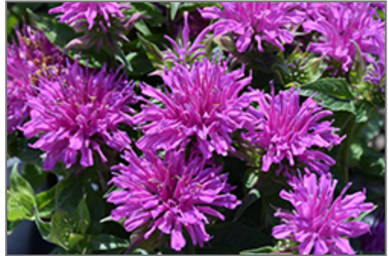
Balmy Lilac Beebalm flowers

We are so proud of the nursery stock that we have carefully selected for superior quality and performance, WE GUARANTEE ALL TREES, SHRUBS, EVERGREENS FOR 2 YEARS, AND ROSES FOR 1 YEAR!