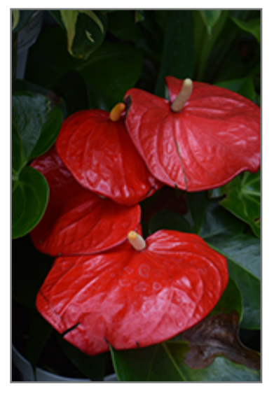
Anthurium flowers

Anthurium features unusual spikes of red heart-shaped flowers rising above the foliage from late spring to mid fall. The flowers are excellent for cutting. Its large glossy heart-shaped leaves remain dark green in color throughout the year.