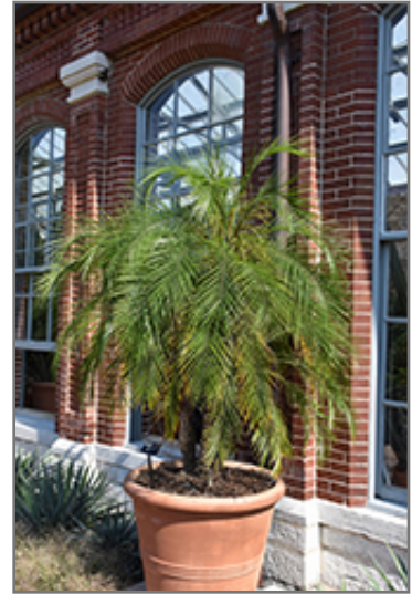
Pygmy Date Palm

This is a multi-stemmed houseplant with a towering form with a high canopy of foliage concentrated at the top of the plant. Its relatively fine texture sets it apart from other indoor plants with less refined foliage. This plant should not require much pruning, except when necessary to keep it looking its best.