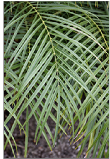
Pygmy Date Palm foliage

We are so proud of the nursery stock that we have carefully selected for superior quality and performance, WE GUARANTEE ALL TREES, SHRUBS, EVERGREENS FOR 2 YEARS, AND ROSES FOR 1 YEAR!