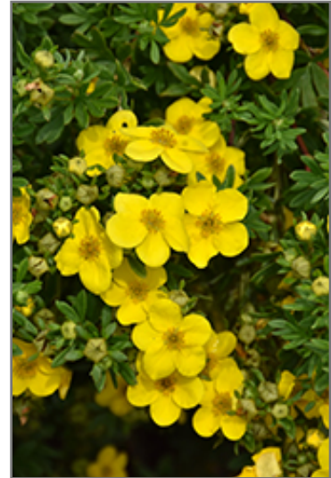
Happy Face Yellow Potentilla flowers

Happy Face Yellow Potentilla is a dense multi-stemmed deciduous shrub with a more or less rounded form. Its relatively fine texture sets it apart from other landscape plants with less refined foliage.