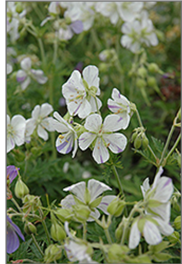
Splish Splash Cranesbill flowers

We are so proud of the nursery stock that we have carefully selected for superior quality and performance, WE GUARANTEE ALL TREES, SHRUBS, EVERGREENS FOR 2 YEARS, AND ROSES FOR 1 YEAR!