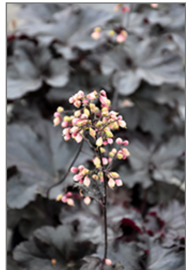
Black Pearl Coral Bells flowers

We are so proud of the nursery stock that we have carefully selected for superior quality and performance, WE GUARANTEE ALL TREES, SHRUBS, EVERGREENS FOR 2 YEARS, AND ROSES FOR 1 YEAR!