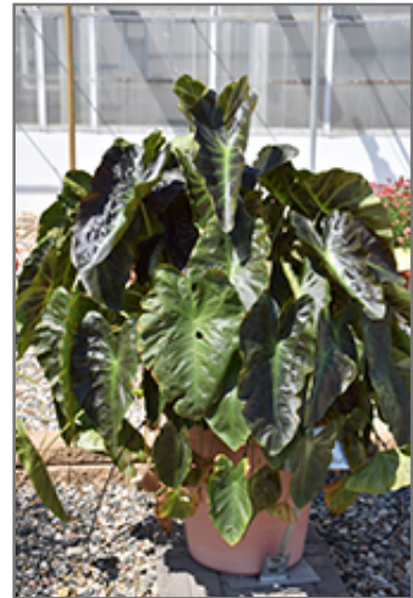
Royal Hawaiian Aloha Elephant Ear

Royal Hawaiian Aloha Elephant Ear is a fine choice for the garden, but it is also a good selection for planting in outdoor pots and containers. Because of its height, it is often used as a 'thriller' in the 'spiller-thriller-filler' container combination; plant it near the center of the pot, surrounded by smaller plants and those that spill over the edges. It is even sizeable enough that it can be grown alone in a suitable container. Note that when growing plants in outdoor containers and baskets, they may require more frequent waterings than they would in the yard or garden.