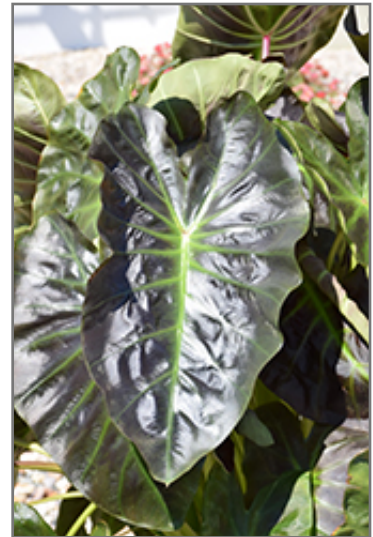
Royal Hawaiian Aloha Elephant Ear foliage

This is a relatively low maintenance plant, and should be cut back in late fall in preparation for winter. It has no significant negative characteristics.