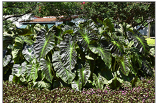
Royal Hawaiian Aloha Elephant Ear

We are so proud of the nursery stock that we have carefully selected for superior quality and performance, WE GUARANTEE ALL TREES, SHRUBS, EVERGREENS FOR 2 YEARS, AND ROSES FOR 1 YEAR!