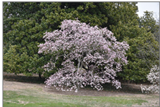
Leonard Messel Magnolia in bloom

We are so proud of the nursery stock that we have carefully selected for superior quality and performance, WE GUARANTEE ALL TREES, SHRUBS, EVERGREENS FOR 2 YEARS, AND ROSES FOR 1 YEAR!