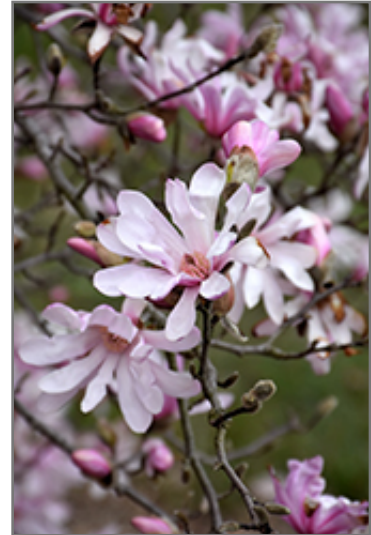
Leonard Messel Magnolia flowers

This is a relatively low maintenance tree, and should only be pruned after flowering to avoid removing any of the current season's flowers. Deer don't particularly care for this plant and will usually leave it alone in favor of tastier treats. It has no significant negative characteristics.