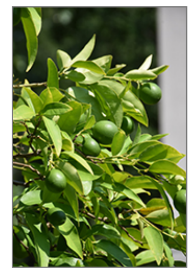
Key Lime fruit