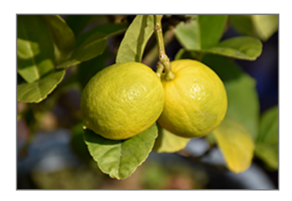
Key Lime fruit