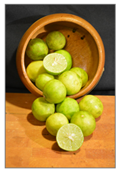
Key Lime fruit and flesh