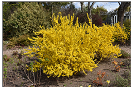
Magical Gold Forsythia in bloom

We are so proud of the nursery stock that we have carefully selected for superior quality and performance, WE GUARANTEE ALL TREES, SHRUBS, EVERGREENS FOR 2 YEARS, AND ROSES FOR 1 YEAR!