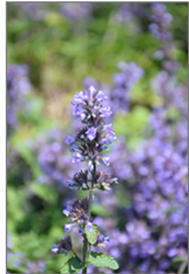
Cat's Pajamas Catmint flowers