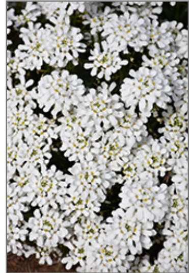
Snowsation Candytuft flowers

Snowsation Candytuft is recommended for the following landscape applications;