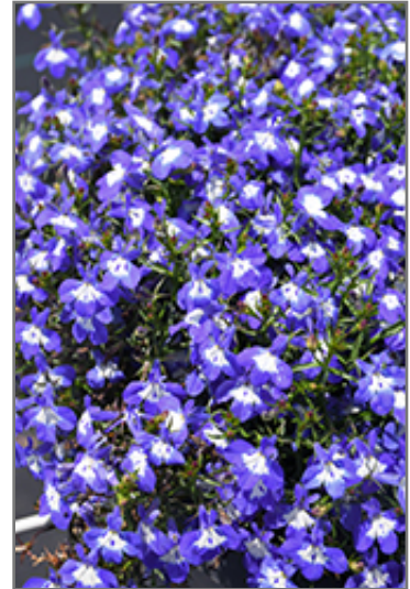
Laguna Compact Blue with Eye Lobelia flowers

Laguna Compact Blue with Eye Lobelia is recommended for the following landscape applications;