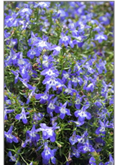
Laguna Compact Blue with Eye Lobelia flowers

We are so proud of the nursery stock that we have carefully selected for superior quality and performance, WE GUARANTEE ALL TREES, SHRUBS, EVERGREENS FOR 2 YEARS, AND ROSES FOR 1 YEAR!