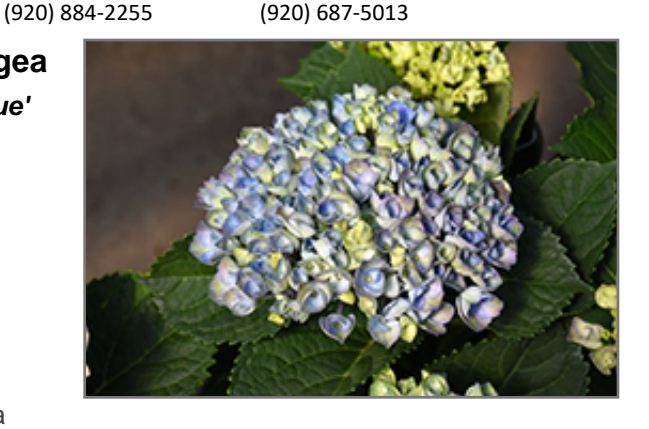
Magical Revolution Blue Hydrangea flowers

Magical Revolution Blue Hydrangea is a multi-stemmed deciduous shrub with a more or less rounded form. Its relatively coarse texture can be used to stand it apart from other landscape plants with finer foliage.