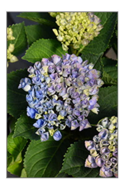
Magical Revolution Blue Hydrangea