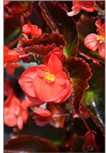
Senator IQ Scarlet flowers

This is a high maintenance plant that will require regular care and upkeep, and usually looks its best without pruning, although it will tolerate pruning. Deer don't particularly care for this plant and will usually leave it alone in favor of tastier treats. Gardeners should be aware of the following characteristic(s) that may warrant special consideration;