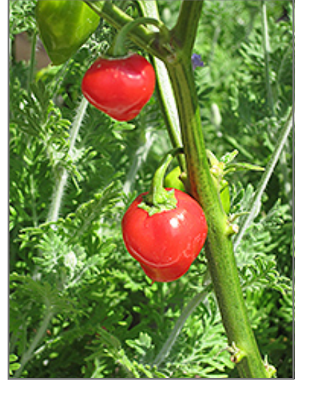
Caribbean Red Pepper fruit