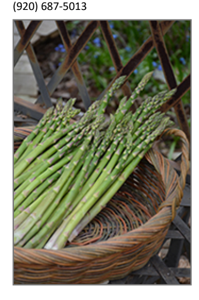
Jersey Supreme Asparagus fruit

Jersey Supreme Asparagus will grow to be about 4 feet tall at maturity, with a spread of 18 inches. When planted in rows, individual plants should be spaced approximately 18 inches apart. It grows at a medium rate, and under ideal conditions can be expected to live for approximately 15 years. As an herbaceous perennial, this plant will usually die back to the crown each winter, and will regrow from the base each spring. Be careful not to disturb the crown in late winter when it may not be readily seen!