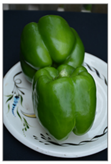
Better Belle III Pepper fruit

A wonderful disease resistant, early maturing variety perfect for any garden; produces large, shiny and blocky bell peppers with thick walls and a delicious, sweet taste; developing from green to red, these are great stuffed, baked, in salads at any stage