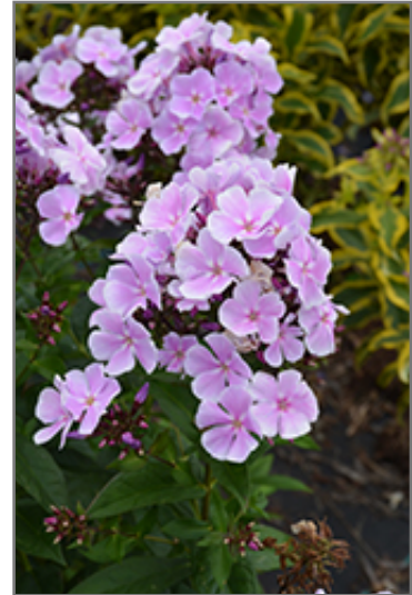
Franz Schubert Garden Phlox flowers

We are so proud of the nursery stock that we have carefully selected for superior quality and performance, WE GUARANTEE ALL TREES, SHRUBS, EVERGREENS FOR 2 YEARS, AND ROSES FOR 1 YEAR!