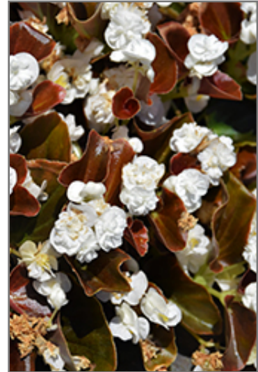
Double Up White Begonia flowers

We are so proud of the nursery stock that we have carefully selected for superior quality and performance, WE GUARANTEE ALL TREES, SHRUBS, EVERGREENS FOR 2 YEARS, AND ROSES FOR 1 YEAR!