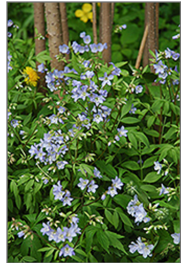
Creeping Jacob's Ladder flowers

Creeping Jacob's Ladder is recommended for the following landscape applications;