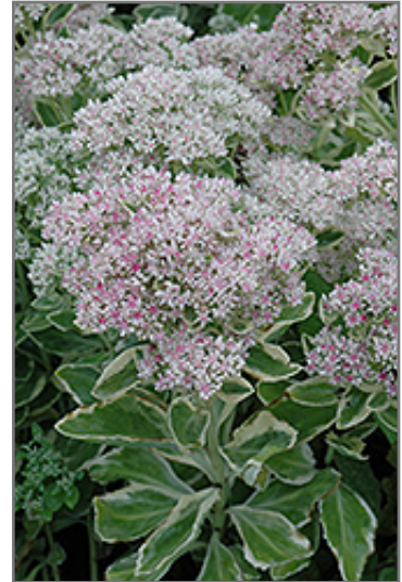
Frosty Morn Stonecrop flowers

Frosty Morn Stonecrop is recommended for the following landscape applications;