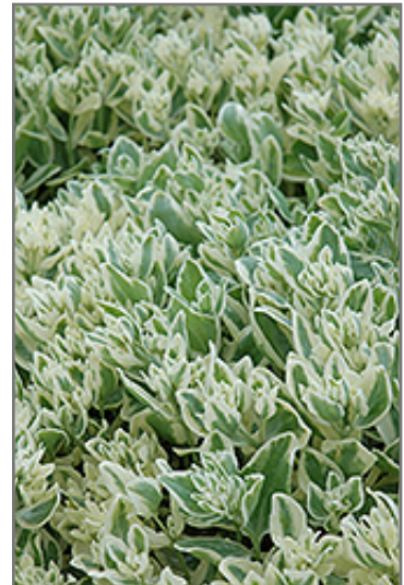
Frosty Morn Stonecrop foliage

We are so proud of the nursery stock that we have carefully selected for superior quality and performance, WE GUARANTEE ALL TREES, SHRUBS, EVERGREENS FOR 2 YEARS, AND ROSES FOR 1 YEAR!