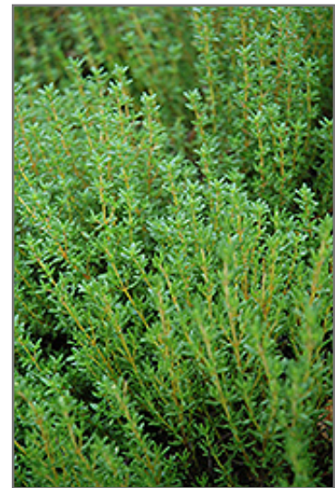
Common Thyme foliage

We are so proud of the nursery stock that we have carefully selected for superior quality and performance, WE GUARANTEE ALL TREES, SHRUBS, EVERGREENS FOR 2 YEARS, AND ROSES FOR 1 YEAR!