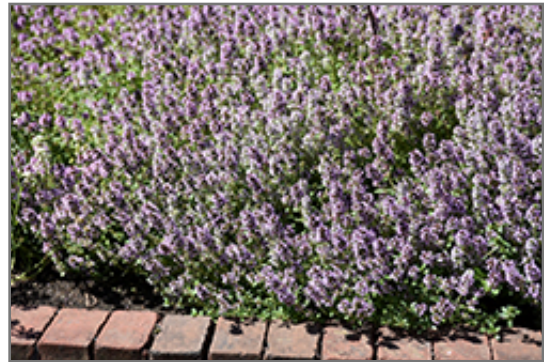
Common Thyme in bloom

Common Thyme is smothered in stunning clusters of pink flowers at the ends of the stems from early to mid summer. Its attractive tiny fragrant round leaves remain grayish green in color throughout the year.